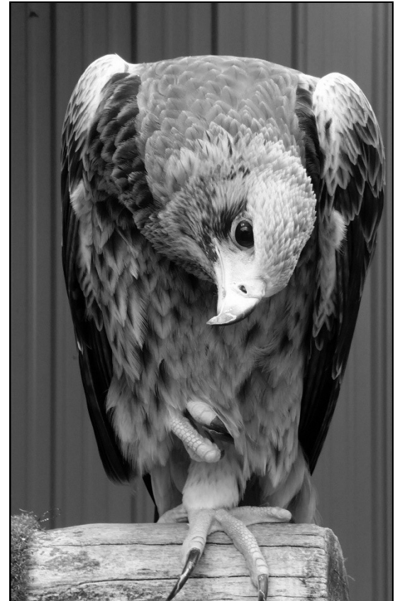
Onyx is one of only six Verreaux's Eagles in the country.

In addition to getting the trailer, the Center was fortunate to also receive a grant through the Community Foundation for Greater Buffalo for construction of our new Eagle Complex,