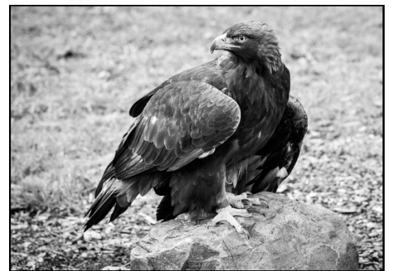
Cherokee was hit by a car when she was 5 years old causing a permanent wing injury. She is now over 50 years old and truly the embodiment of power!